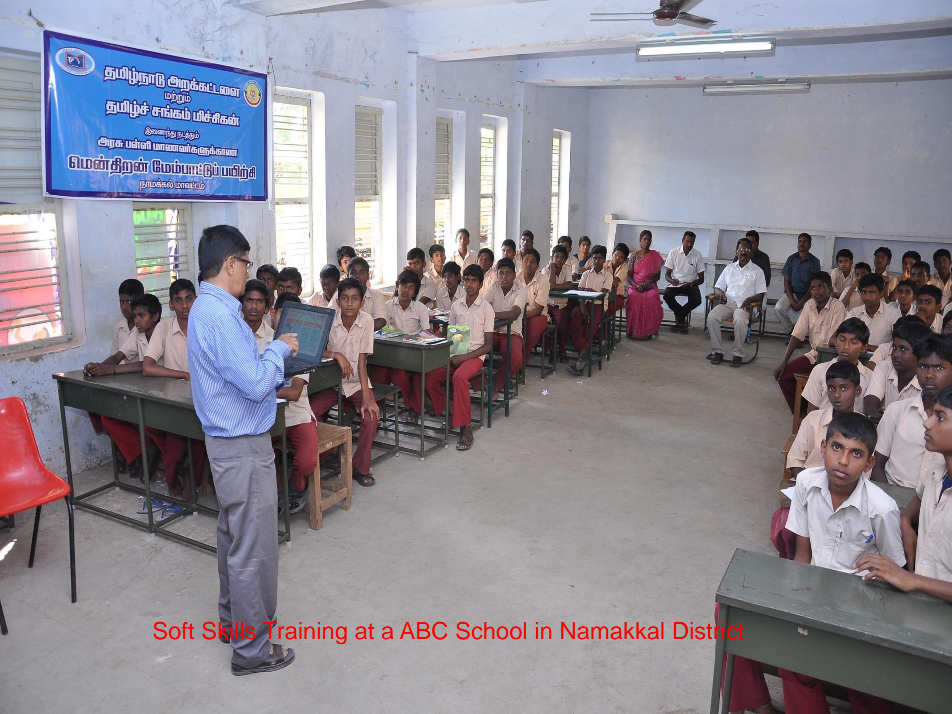
Soft Skills Training at a ABC School in Namakkal District