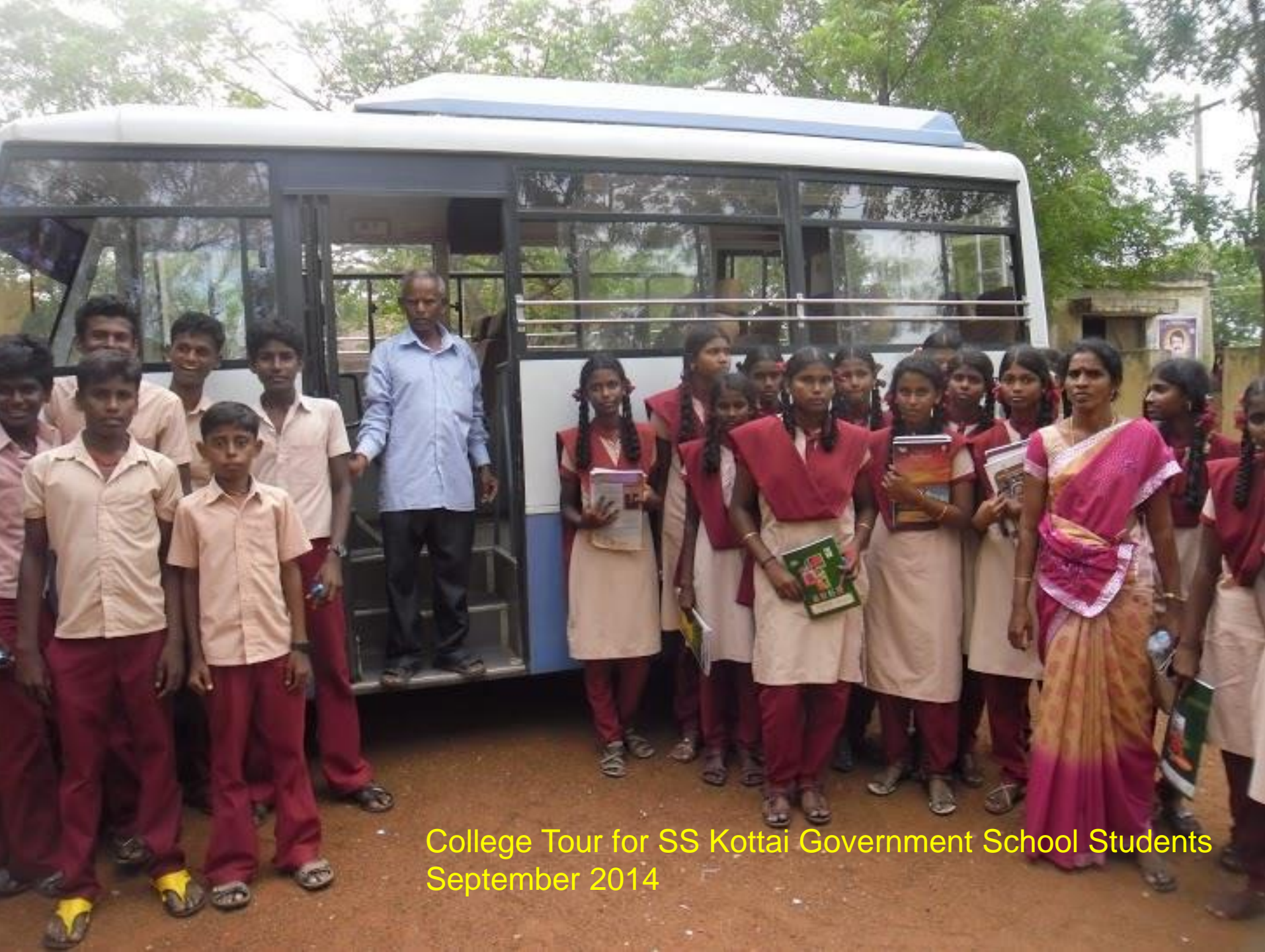
College Tour for SS Kottai Government School Students September 2014